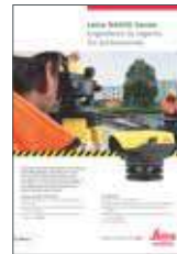
Leica NA500 Series Flyer