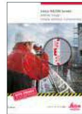
Leica NA700 Series Brochure