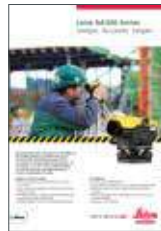
Leica NA300 Series Flyer

PROTECT is subject to Leica Geosystems' international manufacturer warranty and the general terms and conditions for PROTECT. For more information visit www.leica-geosystems.com/protect