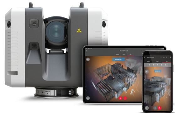
Leica RTC360 3D laser scanner and Leica Cyclone FIELD 360 mobile-device app.

Leica Geosystems AG Heinrich-Wild-Strasse 9435 Heerbrugg, Switzerland +41 71 727 31 31