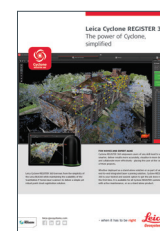
Leica Cyclone REGISTER 360 Data Sheet