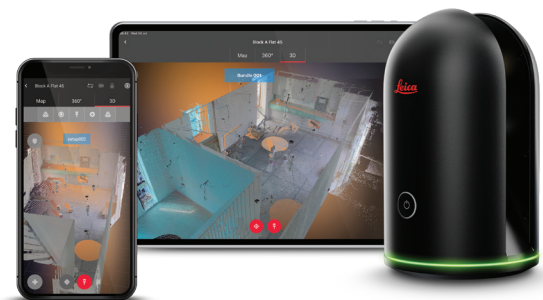
Leica BLK360 3D laser scanner and Leica Cyclone FIELD 360 mobile-device app.

Can be downloaded from Google Play Store and Apple App Store.