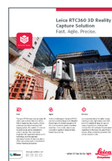
Leica RTC360 Data Sheet