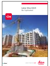
Leica Viva GS15